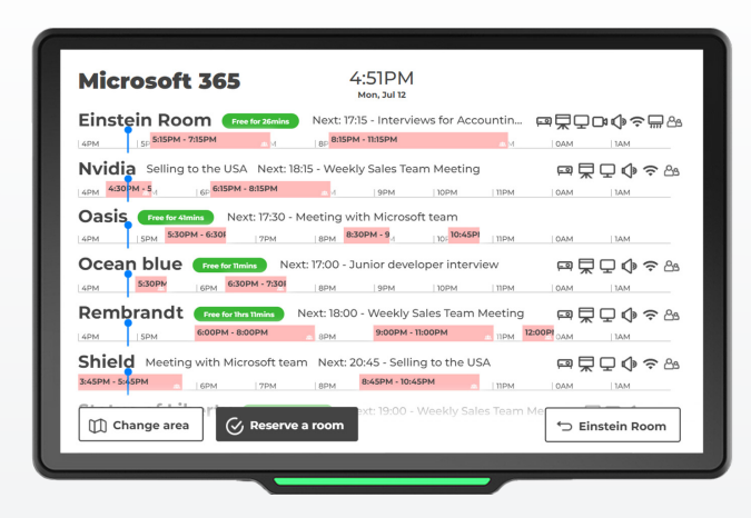
Workspace Signage - branded and flexible

Door Tablet can run either on-prem or in your private cloud, giving you complete security control. Manage all functions using a web browser. Administrators have full control of the Door Tablet system and can fine tune the levels of security and authorizations. Enable or disable security features, including booking and meeting