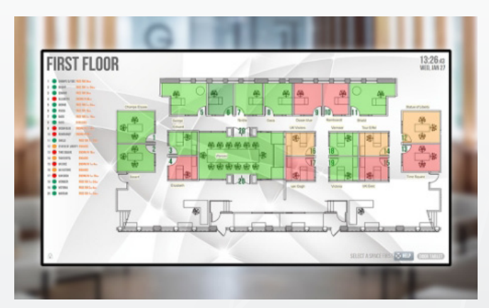
Floor Plan Touch Display

extended features and robust life span. Professional displays work "out of the box" and include mounting kit for any surface, enabling you to put them up immediately. They also include LED lights, PoE and WiFi with power saving features which saves costs and creates a healthier environment.